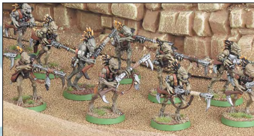
Mercenary Kroot advance through a rocky valley.

Fieldcraft: Kroot are naturally adept in arboreal environments and gain +1 to their cover save in woods or jungles. Kroot in woods or jungles do not have to make a difficult terrain test, they can always make a normal move. If they do not move in the Movement phase, they may see and shoot through 12" of woods or jungle terrain rather than the 6" that would normally be the case.