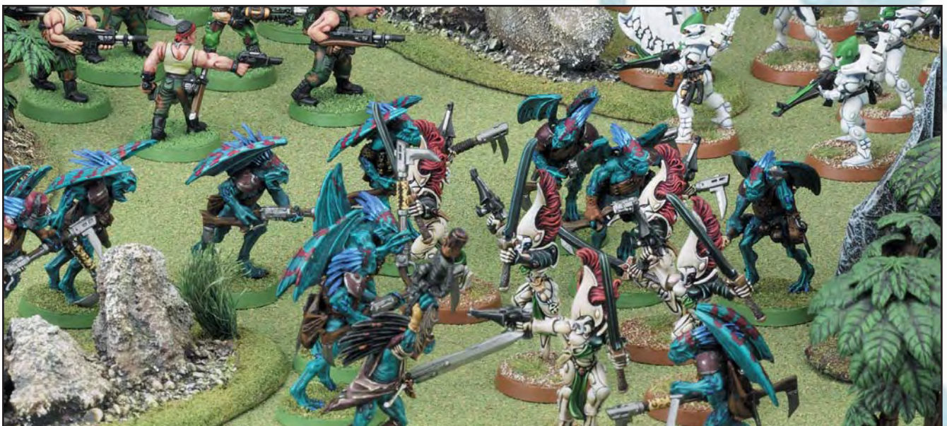
A Kroot Mercenary warband assists the Imperial Guard in staving off an Eldar assault.

Special rules: Punji traps are generally a small pit containing sharp stakes and covered with foliage. Place the small Blast marker over the model that triggered the trap so that the hole in the marker is over the model. Any models fully under the Blast marker are hit automatically, and any partially under are hit on a 4+.